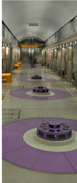
Large, small & medium