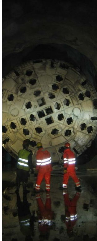
Tunnels, canals penstocks, gates